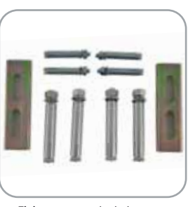
Fixing ground plate

Barrier automation with integrated control unit